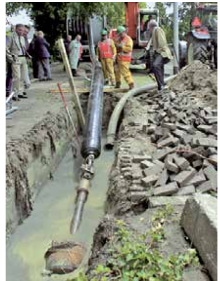
Laying the FLEXWELL FHK by using the horizontal directional drilling method.

This minimal cover requirement is a great advantage when installing new pipes on top of existing concrete trenches (retro-fitting).